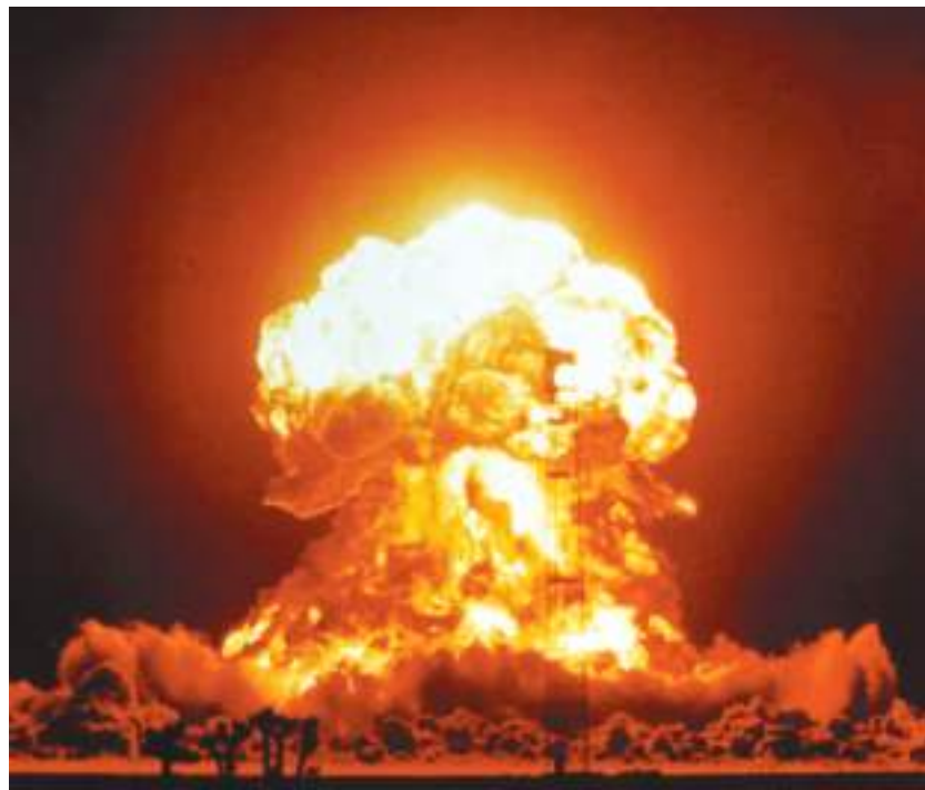
"Nuclear war cannot be won and must never be fought", analysts say.

"That commitment is why the United States joined together with the other Nuclear Weapons States in January to affirmatively state our shared belief that a nuclear war cannot be won and must never be fought, and it is why my administration has prioritised reducing