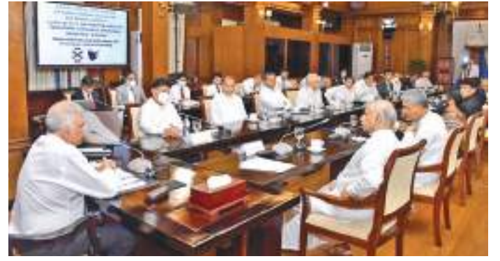
Opposition Leader Sajith Premadasa and a Samagi Jana Balavegaya met President Ranil Wickremesinghe yesterday.

President Ranil Wickremesinghe yesterday suggested to the Samagi Jana Balavegaya (SJB) to name the proposed government as an All-Party Administration if they do not agree to name it as an All-Party Government. The President mentioned this during the discussion with the Samagi Jana Balavegaya led by Opposition Leader Sajith Premadasa held yesterday afternoon. ▶ TO PAGE 03