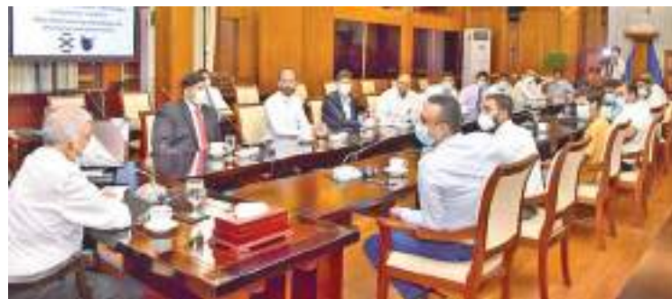
President Ranil Wickremesinghe meeting with Galle Face protesters yesterday.

The President requested them to form a core group representing all protesters at the Galle Face which represents all religions and women. ▶ TO PAGE 02