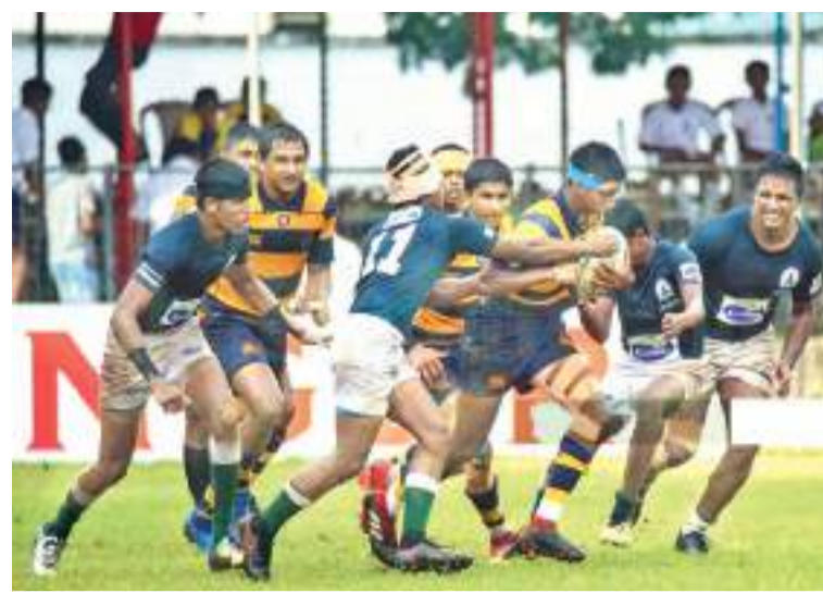
Action from the 2019 match between Royal and Isipathana.

Royal then went on to make it two-in-a-row as the lads from Reid Avenue Captained by the dashing centre three quarter