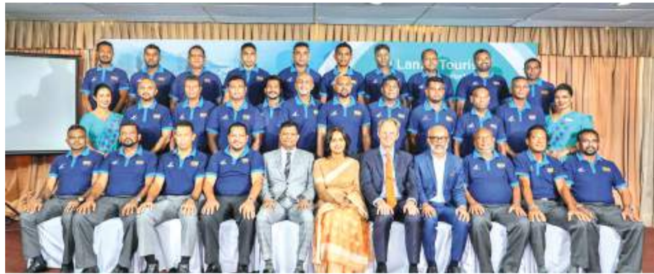
Sri-Lanka Masters Hockey teams with the President of SLMHA, Senior Vice President of SLMHA, CEO and the Officials of Sri-Lankan Airlines, Sponsor and the Co-Sponsor.