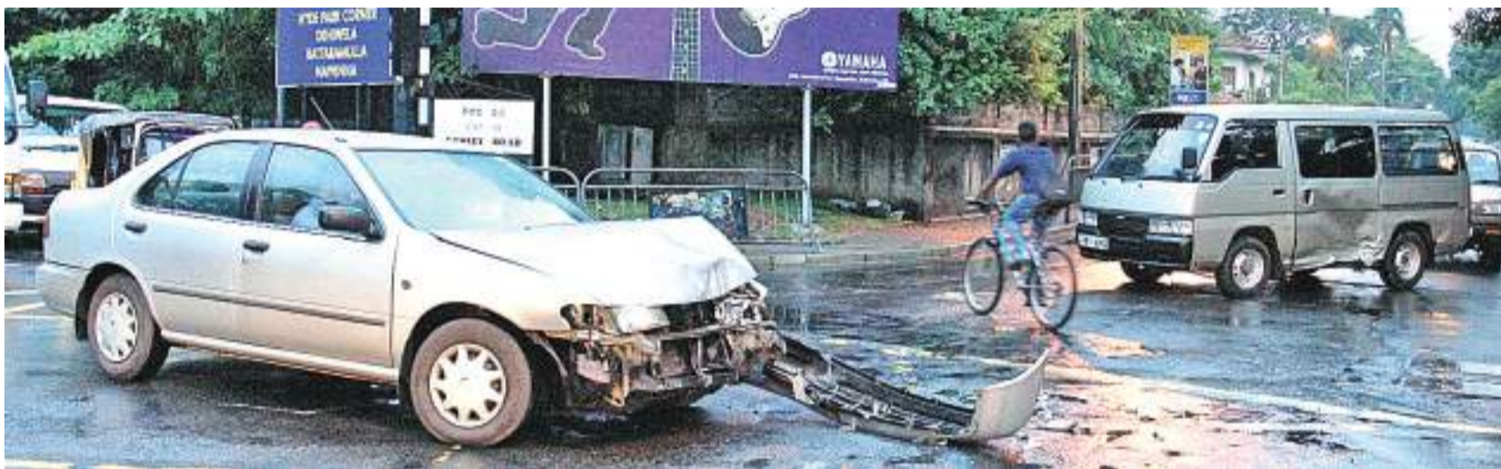
Lack of road discipline, a cause for accidents.

It is important to understand that the present condition or situation on roads didn't happen overnight. The deterioration of the state of affairs happened over a long period of time due to the negligence of many individuals and groups. Some situations are accepted by a majority as a "new normal" and tend to be accepted as "unchangeable". Therefore, it is very important to have "game changers" and "change agents" to bring back road safety at a slow and steady phase.