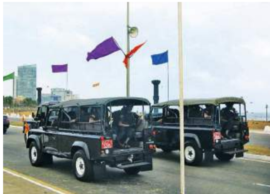
VIP Escort Land Rovers

are back. Slowly but surely they have returned, or are returning and those who heaved a sigh of relief at seeing that they do not have to tolerate politicians being whisked away in motorcades in heavy traffic jams, are now back to the realization that superficial trappings of power die hard.