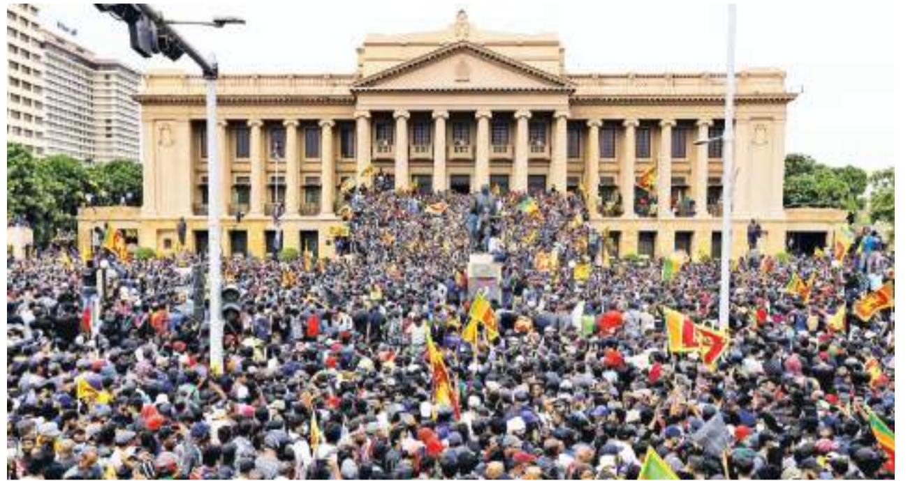
Large crowds gathered at the Presidential Secretariat on July 9.