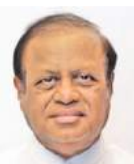
madasa pointed out that it is not fair to some of the development officers if

the examination results would be out in mid August. Meanwhile, Minister Premajayantha said that no unfairness shall be done to the development officers above the age of 35 who would be absorbed into the teaching service. Minister Premajayantha made this observation in reply to a question asked by the Opposition Leader under Standing Order 27/2. Opposition Leader Pre-