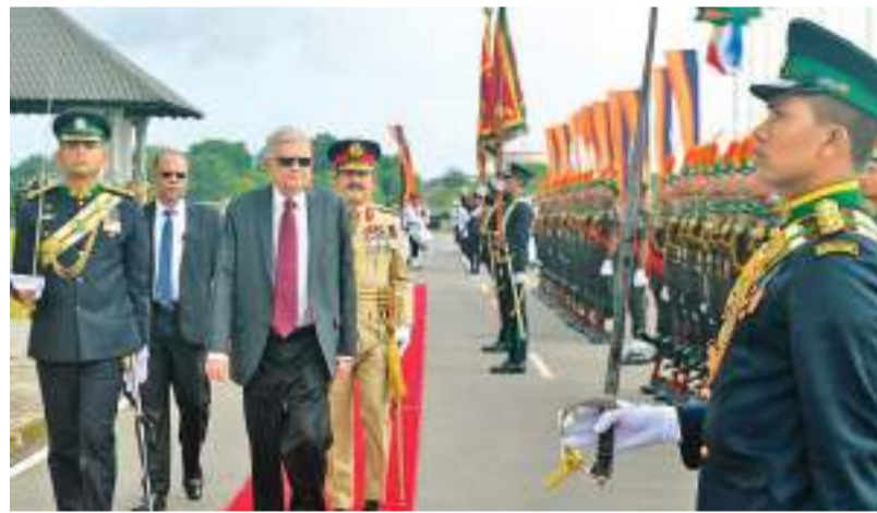
President Ranil Wickremesinghe accepting the guard of honour accorded to him at the Army Headquarters when he made an official visit there yesterday. Army Commander Lt.Gen.Vikum Liyanage was present.

Wickremesinghe also expressed his gratitude to the members of the security forces who took steps to carry out the operation peacefully without firing any shots. The President, who arrived at the Army Headquarters premises, was received by the Commander of the Army, TO PAGE 02