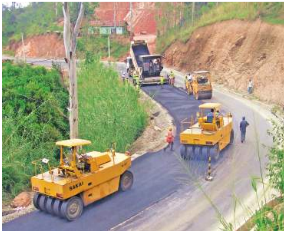
Developing road infrastructure.