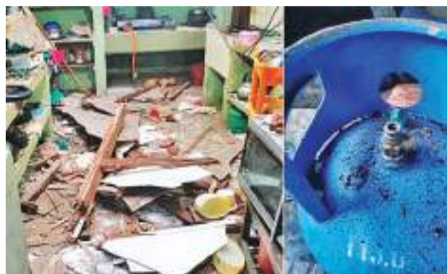
Damage caused by gas explosion.

"When the crisis began, we did not anticipate a shortage of gas, like most people. It was only a few days later when we realized that there was a shortage, creating a huge demand for gas. We used the gas which was available only for frying purposes. For the cooking of vegetables and rice we used the rice cooker. The electric kettle was used to boil the water. Soon, we shifted to electronic cooking devices. You can imagine the electricity bills! It was three times more than the previous month's. Before we moved to electric devices, we depended on fast food for our breakfast, lunch and dinner. But when that became too expensive we relied on electric devices. However, even electronic devices could not be used during power cuts leaving us completely helpless. It was a time consuming process to get a cylinder. I gave up the idea of getting the cylinder standing in line, because I