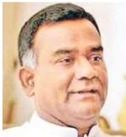
He said leading such important Committees by Government Members of Parliament is not suitable since there would