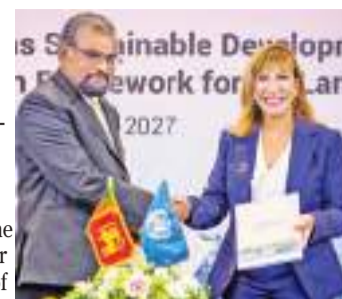
The United Nations Sustainable Development Cooperation Framework (UNSDCF) 2023-2027 was launched