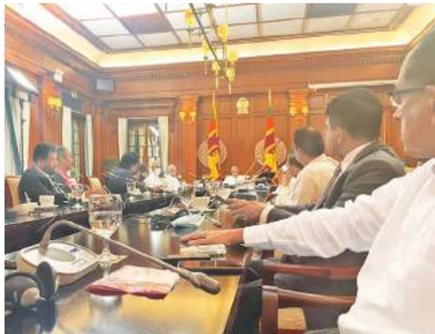
President Ranil Wickremesinghe met the Samagi Jana Balawegaya (SJB) group led by Opposition Leader Sajith Premadasa to discuss the formation of an All-Party Government recently.