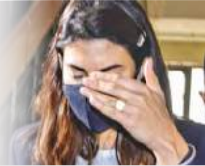
Bollywood actress Jacqueline Fernandez arrives at Enforcement Directorate office for questioning in connection with a money laundering case, in New Delhi.