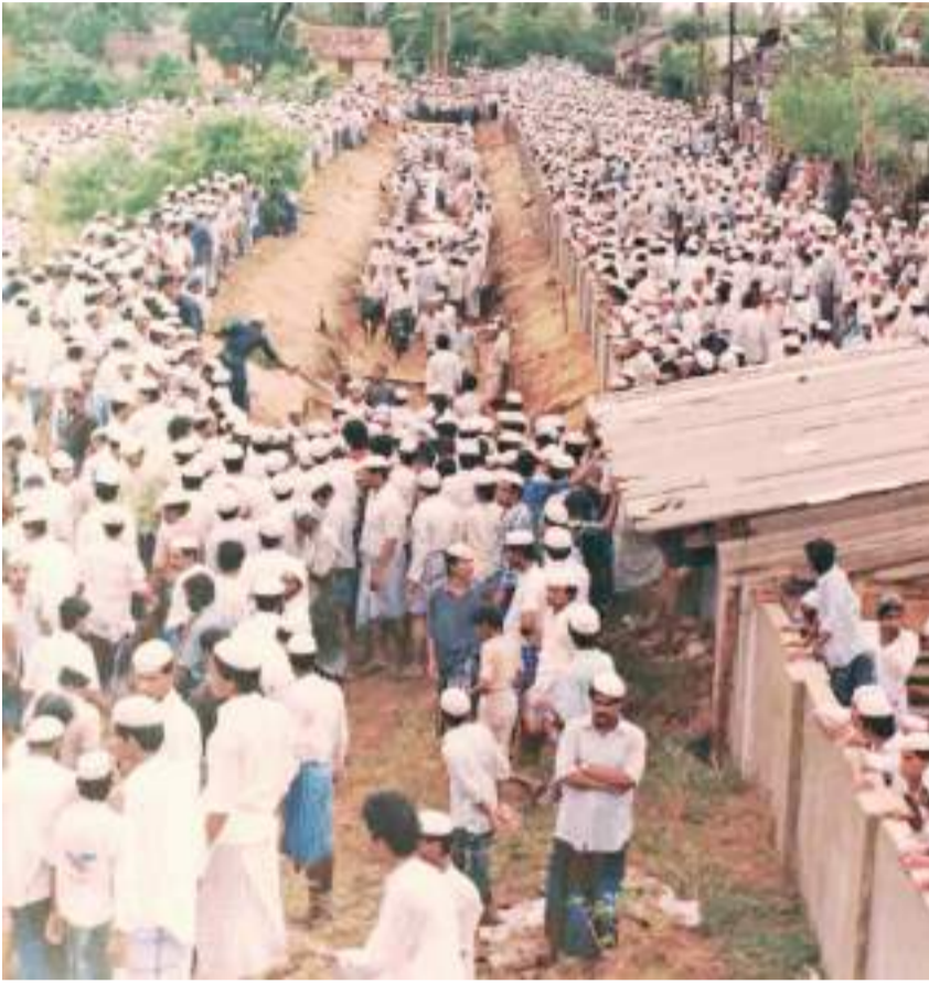
Kattankudy Mosque killings.

As the civilians knelt in prayer when the LTTE terrorists attacked them, spraying automatic fire and hurling hand grenades at the worshippers. Most of the victims were shot in the back or side. The LTTE terrorists fled as Sri Lankan soldiers, notified of the ongoing massacre, arrived at the scene. Initial report put the death toll at around