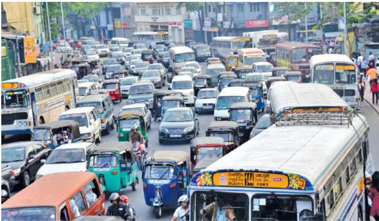
Minimising traffic congestion will save fuel.

permits issued are much higher than its requirements. Since the number of owners of those buses is also high, they have to compete with other bus owners to earn their cost harassing passengers. It is not an unknown fact rather negligence of decision makers to improve the situation.