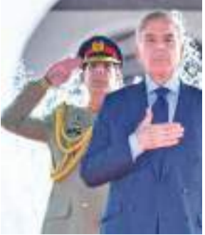
PM Shehbaz Sharif

He said that the fifth-largest country in the world, where two out of every three people are below the age of 30 and full of aspirations, finds itself stuck with an income level of just USD 1,798. - NDTV