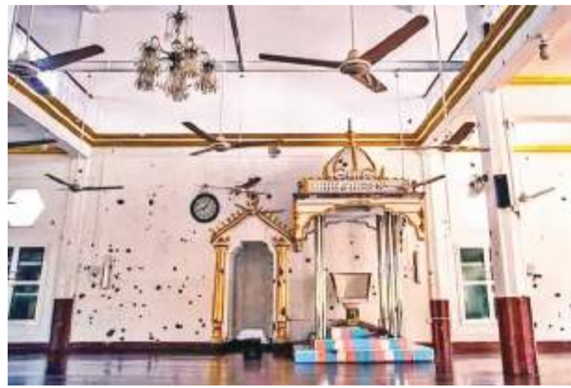
One of the mosques attacked by the LTTE in Kattankudy.

Sri Lanka Air Force helicopters rushed the injured to hospitals for urgent treatment. They continued to ferry the injured to hospitals