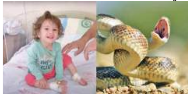
The two-year-old girl is now reported to be fine and recovering from the incident.

TURKEY: A two-year-old girl responded to a snake biting her lip by biting it back and killing the reptile, according to a report in news.com.au . The shocking incident took place in the village of Kantar, near Bingol, in Turkey, on August 10, said the outlet. Her neighbours performed first aid and rushed little girl to a children's hospital after the incident where she was placed under observation for 24 hours. She is now reported to be well and recovering, news.com.au further said.