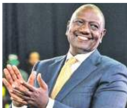
Kenya's President-Elect William Ruto

He went to primary school barefoot, wearing his first pair of shoes at the age of 15. He also sold chicken and ground-