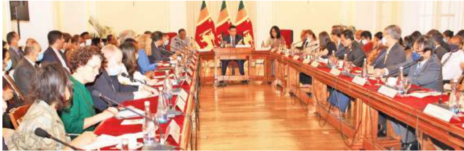
Foreign Affairs Minister Ali Sabry, PC briefing Colombo-based Ambassadors and High Commissioners on current developments on Monday at the Ministry of Foreign Affairs. Attorney General Sanjay Rajaratnam, Foreign Secretary Aruni Wijewardane and Finance Secretary Mahinda Siriwardana were also present.

Minister of Foreign Affairs Ali Sabry, PC met the Colombo-based Ambassadors and High Commissioners on Monday August 15, 2022 at the Ministry of Foreign Affairs for a briefing on current developments ahead of the 51st session of the Human Rights Council in Geneva.