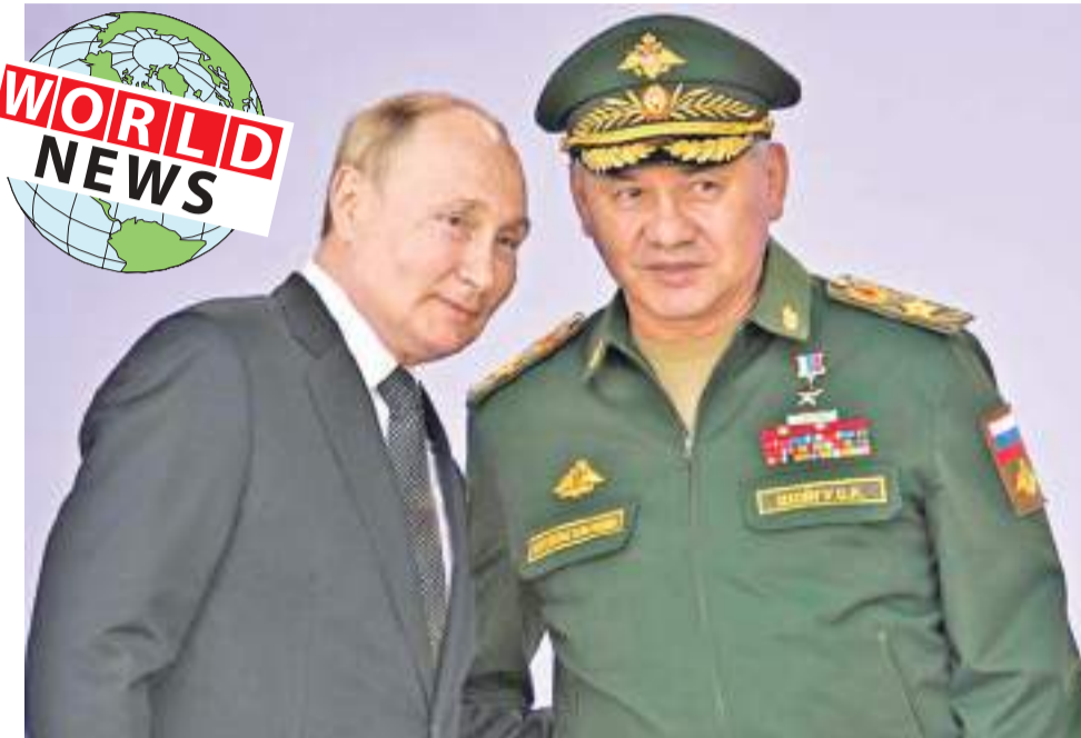
Russia's President Vladimir Putin and Russian Defence Minister Sergei Shoigu attend the opening of the Army 2022 International Military and Technical Forum in the Patriot Park outside Moscow, Russia on Monday.