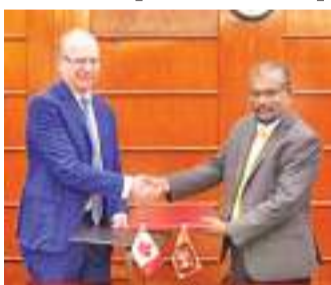
The MoU being exchanged

Funded by Global Affairs Canada, the Innovative Global Networks for Inclusion and