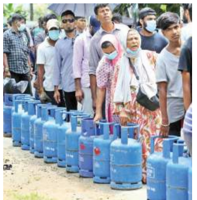
People can now buy their cooking gas without waiting in queues.