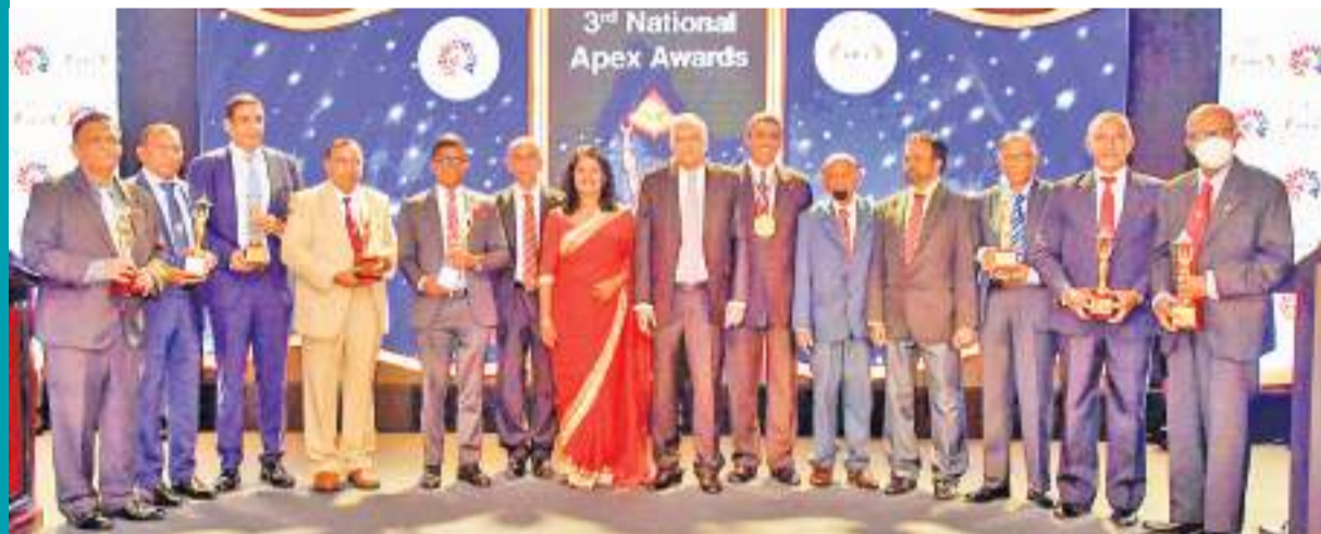
The President with the awardees.

This is a part of new Sri Lanka where we are widening the horizon of economic activity and for governance and I am sure you'll take part wholeheartedly and let's all get together because this is the last chance we have. If we don't pull it off, I don't think there will be a fourth National APEX Award.