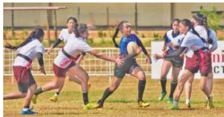
A women's rugby match (File photo)

The Grassroots to Global Series - Sri Lanka Forum organised by Sri Lanka Rugby (SLR), will be held at the Mandarin Hotel, Colombo at 9.00 a.m. onwards from August 20 to 21, with Childfund Rugby, which is a renowned organisation for development promotion, being the main sponsoring body. The main objective of this forum is to promote female rugby and the development of leadership among Women who are engaged in rugby. Therefore, 25 school Physical Training Instructors (PTI) from covering seven different Provinces were given the opportunity