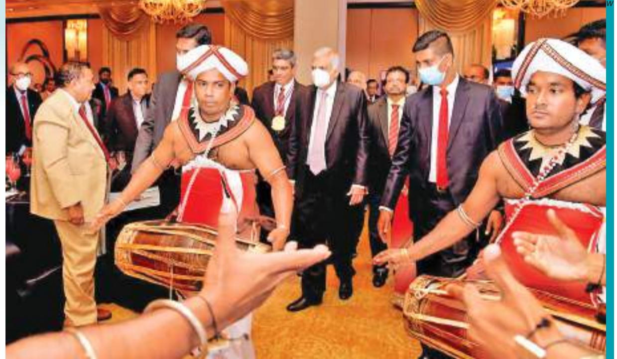
The President being conducted to the venue.

on integrated trade agreements, but you will not lose out on it. If you don't go for that market you have no future. All you have to do is look out and go out. The government has to come out with plans to help you. We have to find these big markets to become competitive and there are areas to look at like logistics. We can serve the whole region, if Colombo, Hambantota and Trincomalee harbours are properly developed. One of the areas as you mentioned here is Agriculture. With 500 million additional people to feed, why not modernize our agriculture, not traditional agriculture. There are many of you here who can help to take part. The services, the new technologies, developing tourism to a different level. We have to get ready for 4th Industrial Revolution and you'll know what those technologies are. How it can be used and how you can make money. That's what we want you to do, but it means complete restructuring of our economy. When the government sector falls there still we must have enough money and income to fund education and health, a new system of education, social mobility comes from education and health system and housing, those are basic needs. So we moved towards the social marketing economy. That is restructuring what we have. Then the governance itself, everyone admits this model has failed. Now are we going to do the same politics again? To bring the same model back? This is the question for all those