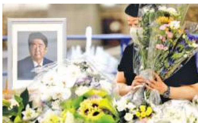
A woman pays a floral tribute to Shinzo Abe who was Japan's longest-serving Prime Minister.

JAPAN: Japan's national Police Chief has resigned from the post on Thursday taking responsibility for the fatal shooting of former Japanese Prime Minister Shinzo Abe at a campaign speech last month.