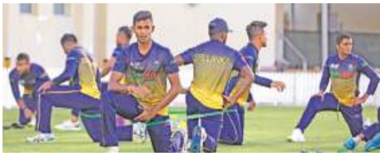
Sri Lanka players during a training session ahead of the Asia Cup 2022 at ICC Academy in Dubai.