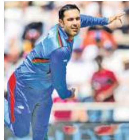
Mohammed Nabi (Afghanistan Captain)