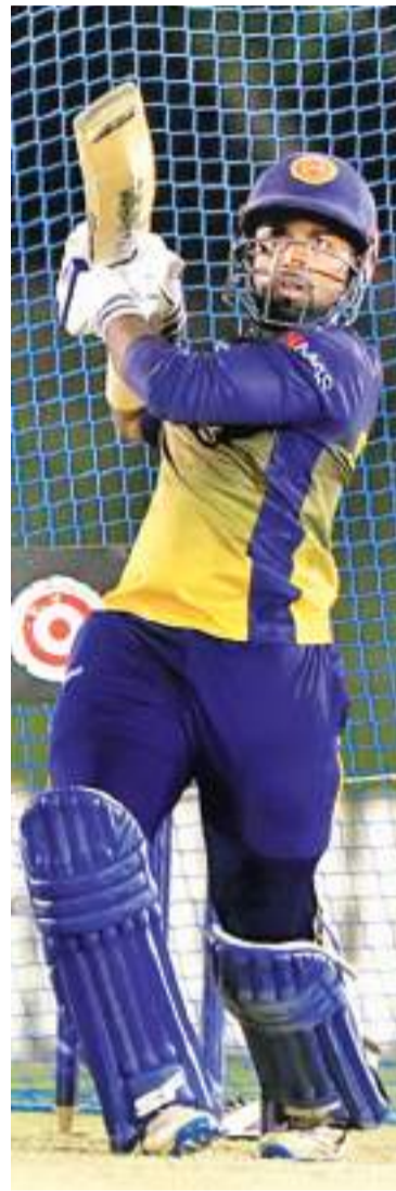
Charith Asalanka of Sri Lanka bats during a training session.