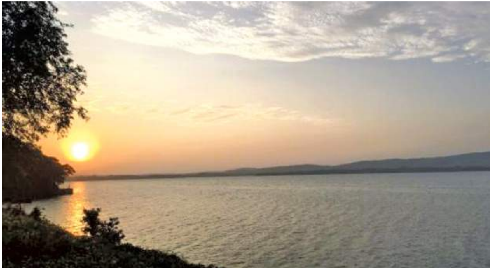
The scenic Kanthale Wewa