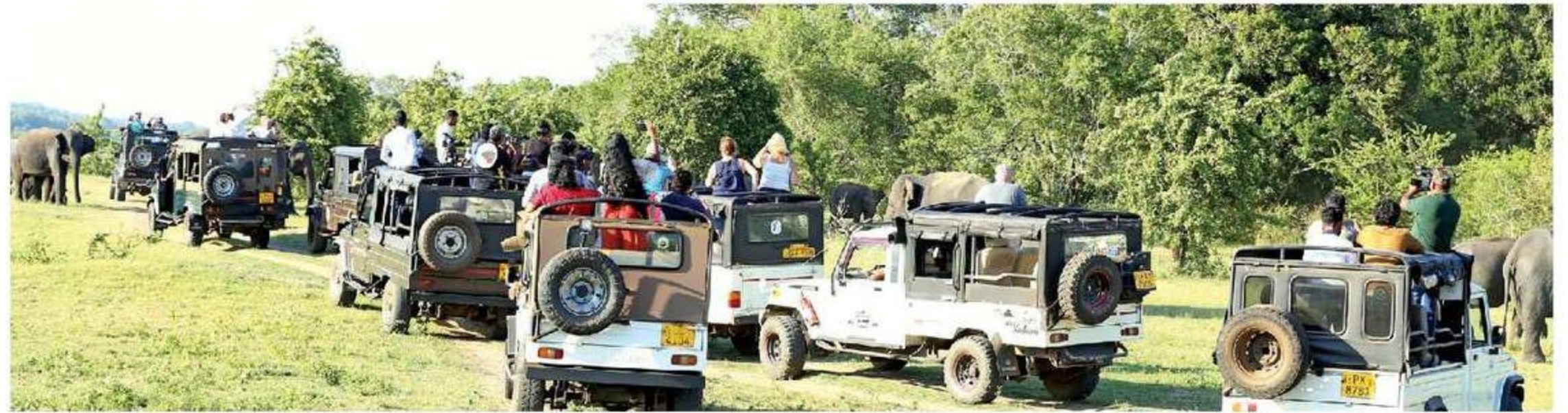
Tourists in abundance.

He further stated that Habarana is a unique location, with Sigiriya and Minneriya located close by. The entire region is vital when it comes to the progress of the Sri Lankan Tourism Industry. "This is why we have chosen to conduct a media tour of Habarana. It is synonymous with the theme – 'Rethinking Tourism' ."