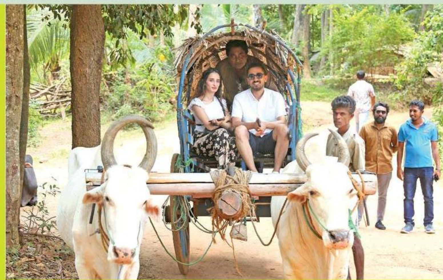
Bullock Cart with foreigners.

Hiriwadunna Village, is a quaint little place full of activities for tourists. It is part of the package which costs Rs. 2,500. When the tourists come to the Hiriwadunna junction, they can get into a bullock cart and then the boat takes them to the village. There is a cooking demonstration. If they want, they can cook their own food with the assistance of the villager. For the tourists it is new and exciting experience. It is a chance to make village food, eat village food and experience village life!