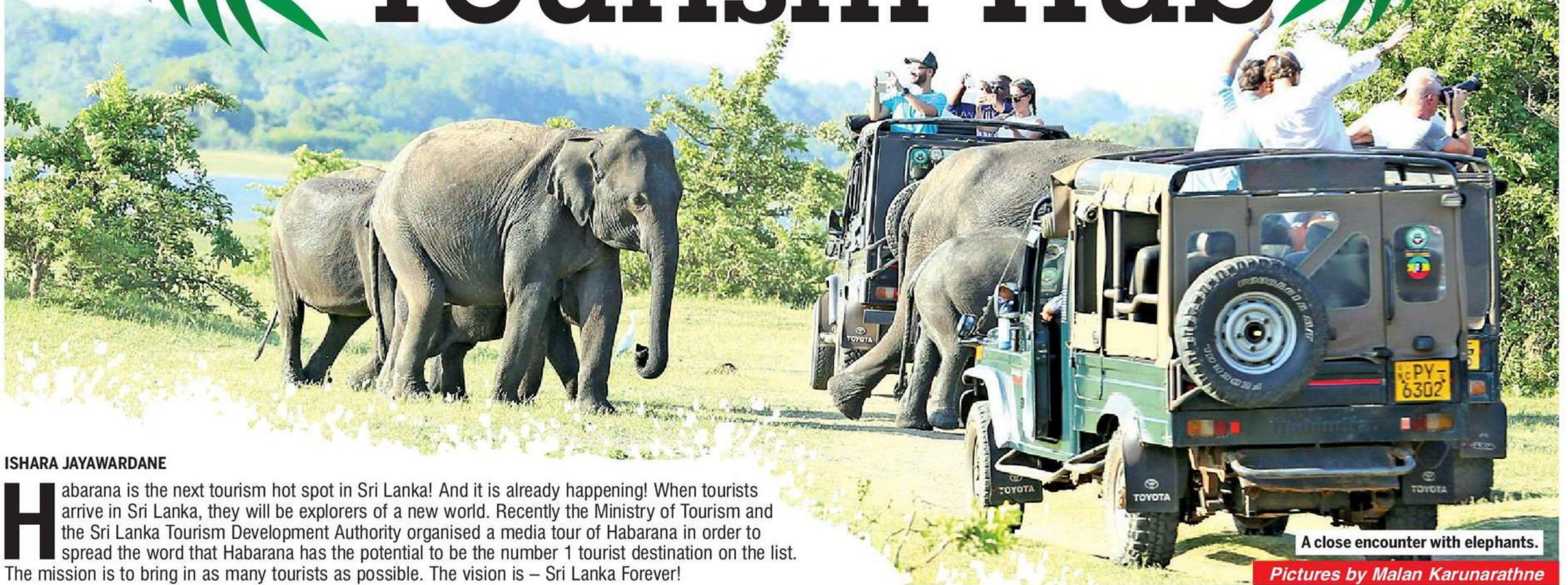
A close encounter with elephants.