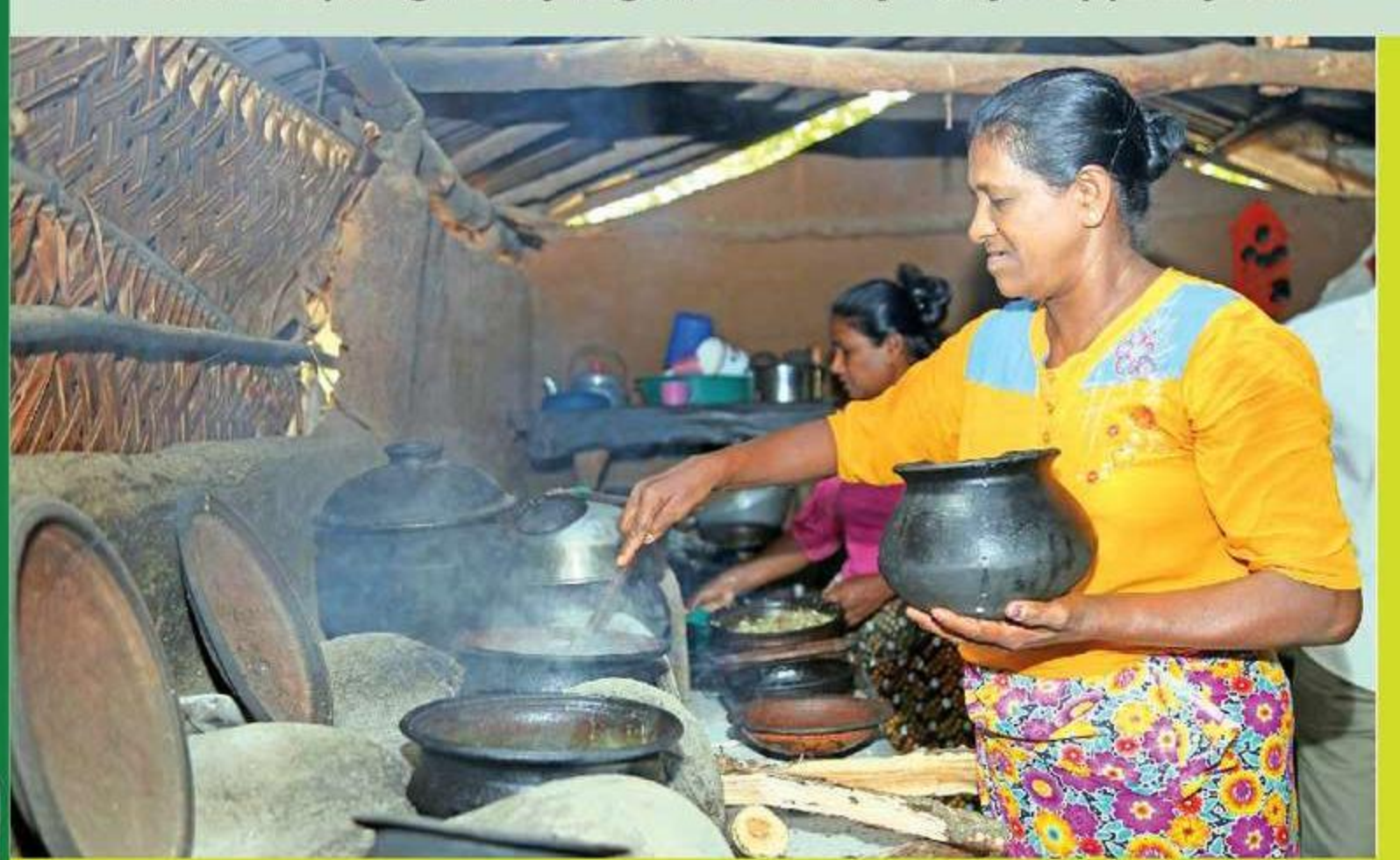
Women preparing food at the Hiriwadunna village.