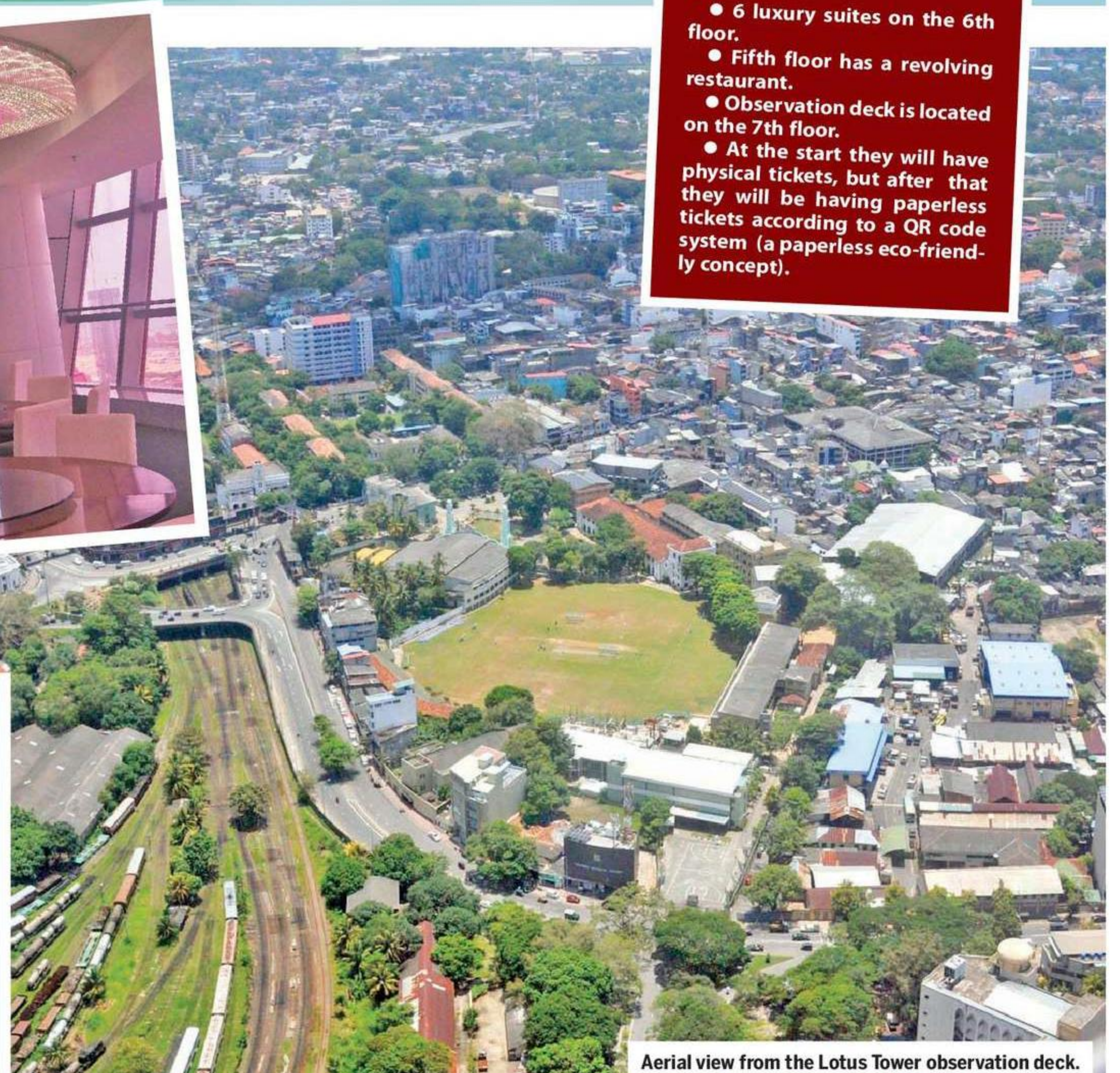
Aerial view from the Lotus Tower observation deck.