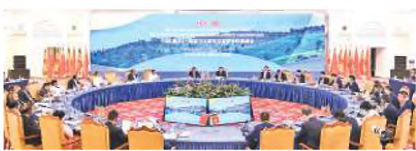
Chongqing-Sri Lanka Roundtable on Poverty Alleviation and Development Cooperation at Temple Trees, Colombo