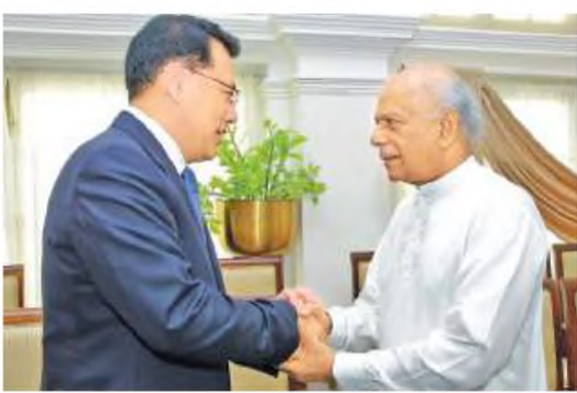
Prime Minister Dinesh Gunawardena and Secretary of the CPC Chongqing Municipal Committee Dr. Yuan Jiajun.