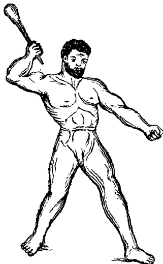
TRADE MARK "HERCULES" CHEST.

The essential particulars of the Trade Mark is a figure of "Hercules."