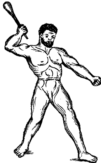
TRADE MARK "HERCULES" CHEST.

The essential particulars of the Trade Mark is a figure of "Hercules."